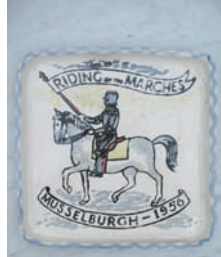
Ceramic ware created by Fisherrow Potteries Riding of the Marches 1956