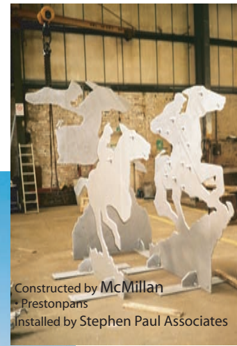
Constructed by McMillan • Prestonpans Installed by Stephen Paul Associates